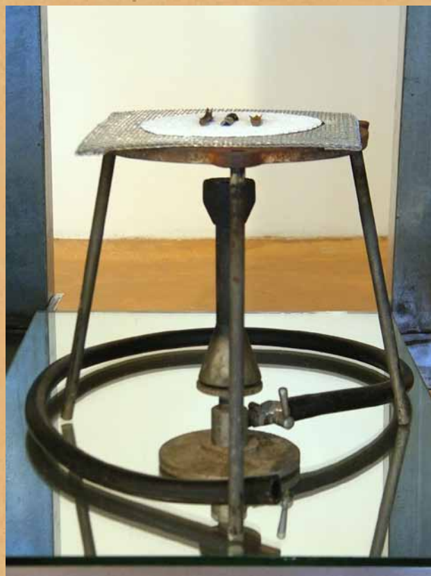
Burner, Ceramic net, Drawing nibs