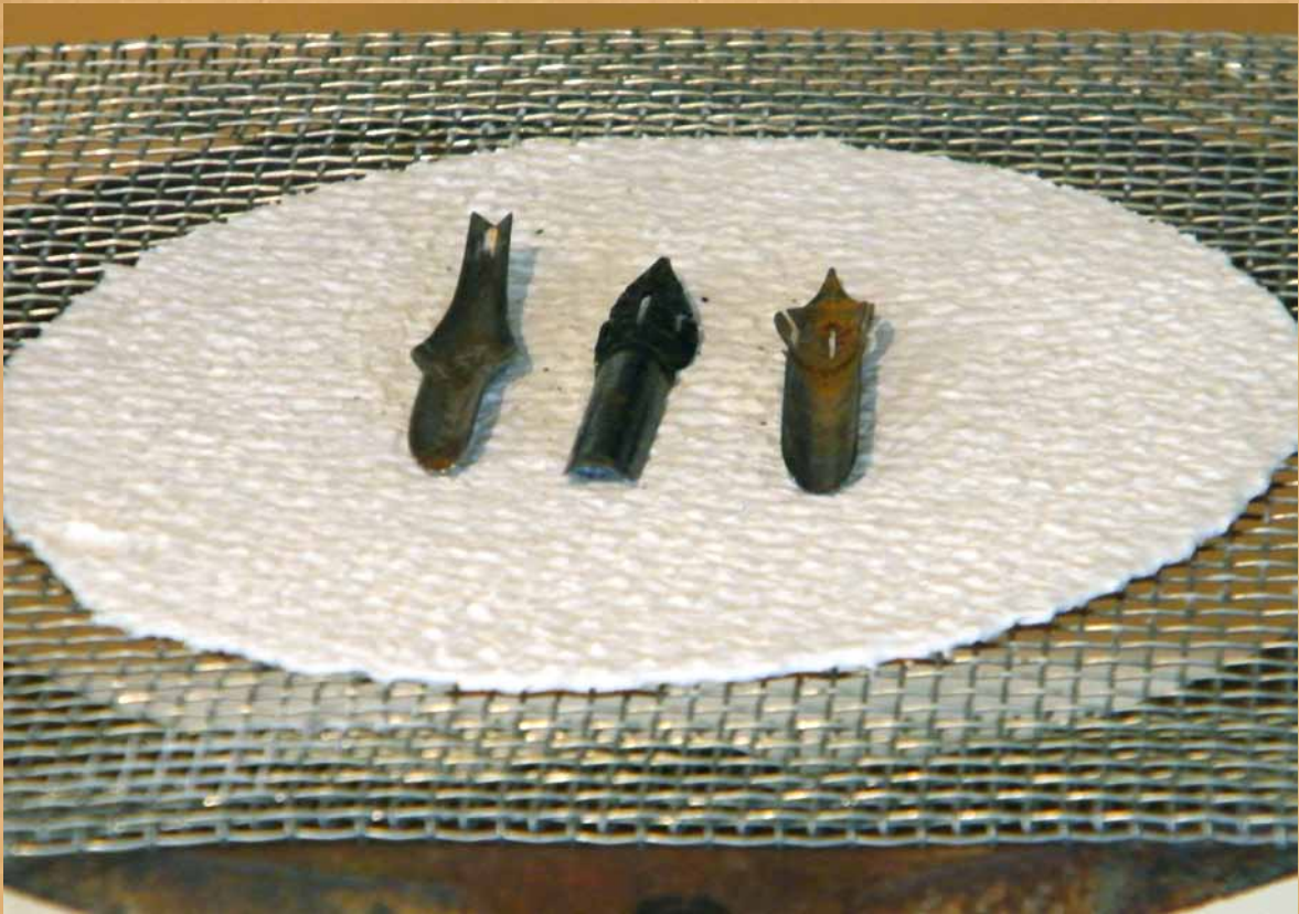
Drawing nibs on ceramic net