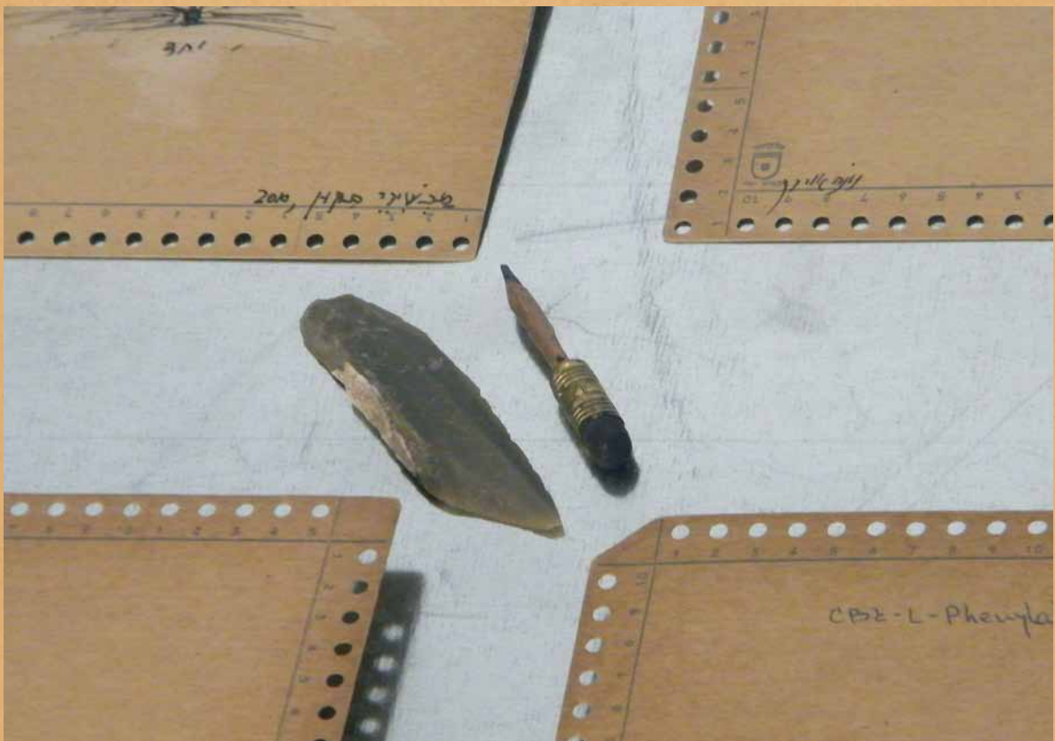
Installation from above; [fragment] archive laboratory cards, pencil, flint.