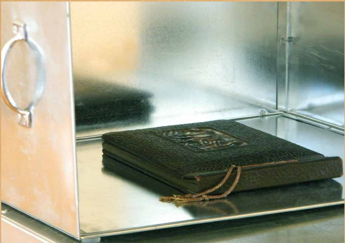
Album, Sheet metal drawer