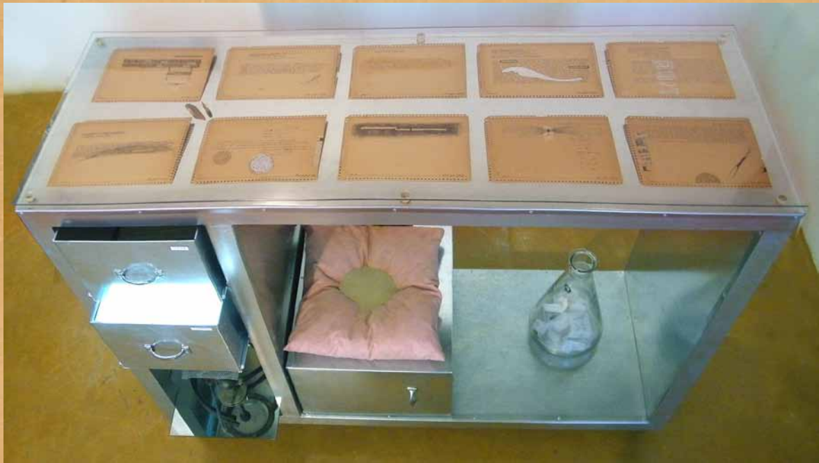
Installation from above