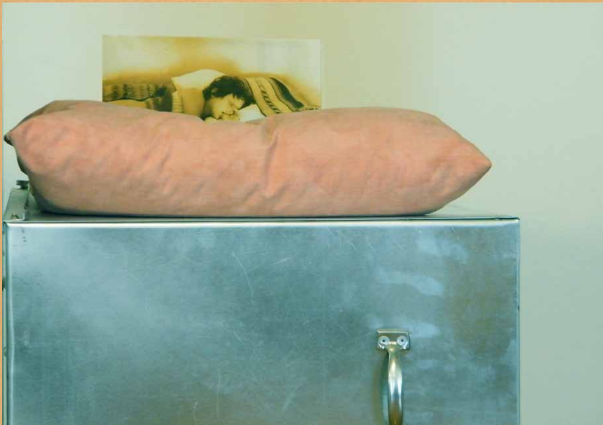
Photo, Feather pillow, Sheet metal drawer